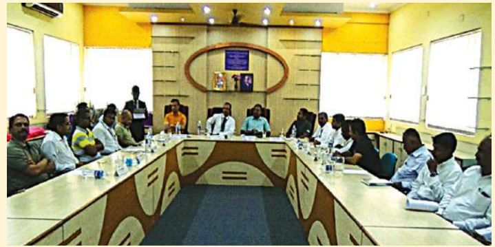
Team Black & Veatch Visit at TKIET