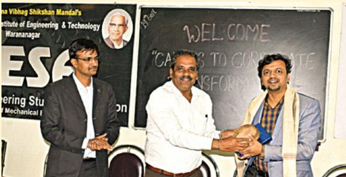
Campus to Corporate Transformation Program by TCS Team