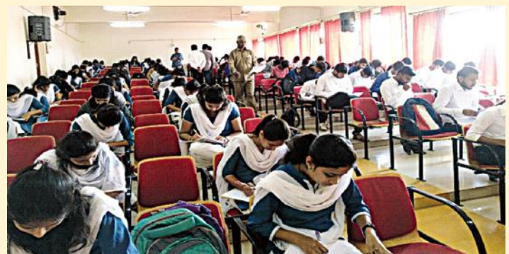
Students Attending Campus Drive