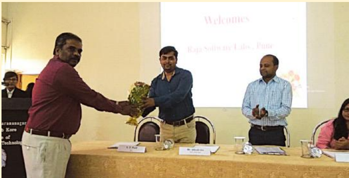
Campus Placement Drive by Raja Software Labs, Pune