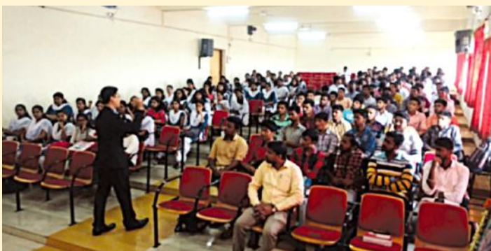
Presentation by AON Cocubes: Assessment & Hiring Platform