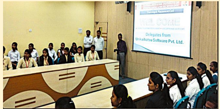
Campus Placement Drive by Unikaihatsu Softwares Pvt Ltd, Mumbai