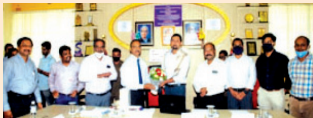
Deccan Fine Chemicals (India) Private Limited Campus Recruitment Drive