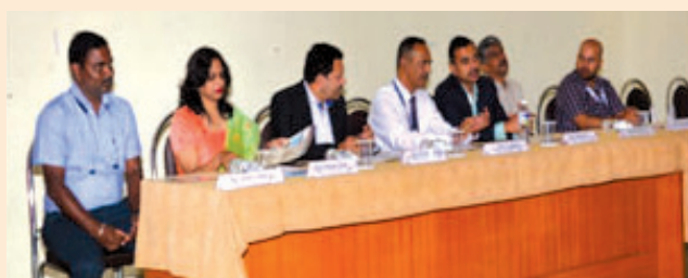
Praj Industries Campus Placement Drive