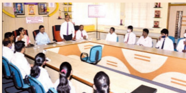
Students Attending Pre-Placement Talk of Wynum Automation Services Pvt. Ltd,Pune