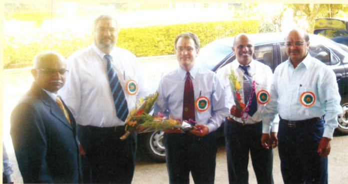
TKIET Welcomes the Delegates from GVS, U.S.A