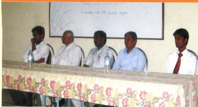
Inauguration of INSPIRO 2K9