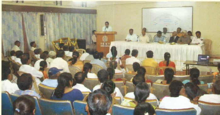
Active Participation of Parents in P.T.A. Discussion