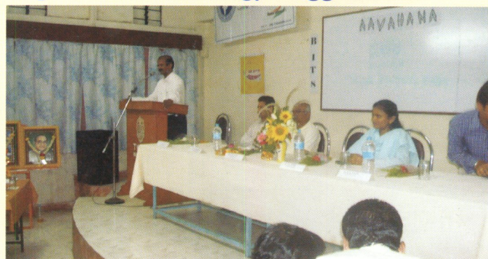
'AVAHAANA'- Call For Entrepreneurs