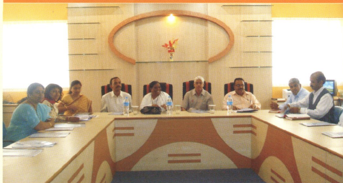
One day workshop on Syllabus Revision