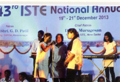
Entertainment program for the participants by world renowned 'Warana Childrens' Orchestra'