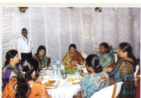
Delicious and sumptuous dinner served to the ISTE participants and guests