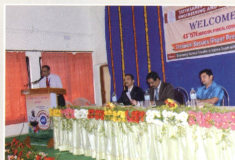
Three technical sessions were conducted to share the views of authors about their papers.