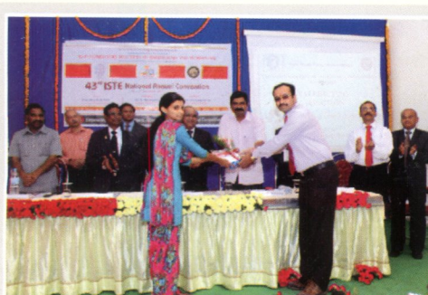
Best project award winners were honoured during the Valedictory Function