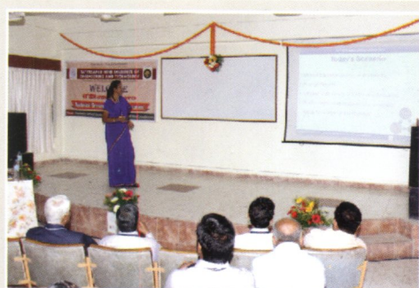
Research papers presentation by the participants on various sub themes of the convention