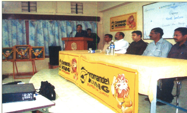
Guest lecture on "Concrete Mix Design".

A Guest lecture on "Concrete Mix Design" was organized on 28 th August 2010. The resource person was from India Cement who addressed and guided the students on some of the most important aspects on the above said subject to the Civil Dept. students from SE to BE. Both the event were well appreciated by the audience.