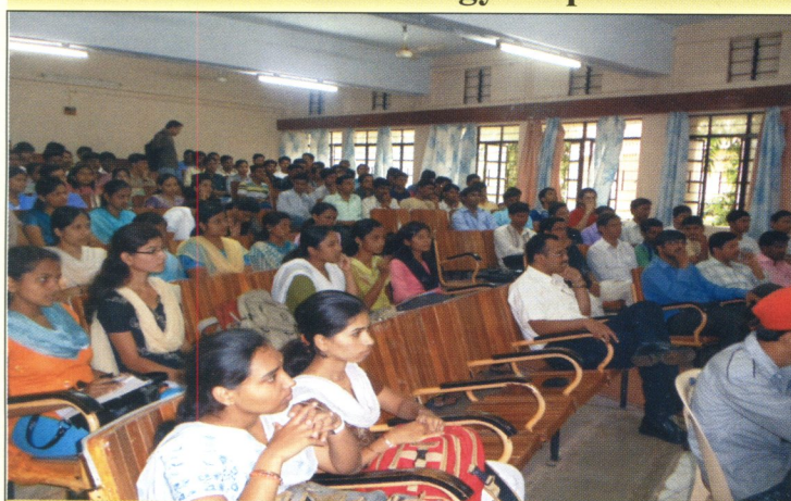
Guest Lecture on International Certification