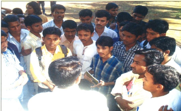
Workshop on "Modern Surveying Techniques using Total Station"