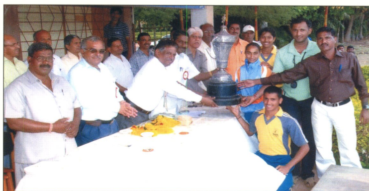
University level Inter Zonal Athletic Meet hosted at TKIET