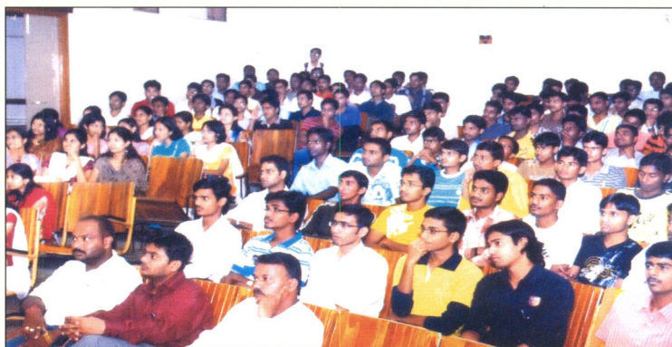
Guest Lecture on Competative Exams

Career development Cell is organizing different activities for student's awareness. It provides information on competitive examinations like GATE, GRE, TOFEL, MBA as well as conducts various guest lectures on preparation of competitive examinations, personality development and communication skills. To enhance student's employability, organizes Mock Group Discussions, Mock Interviews and Aptitude tests. It also arranges activities like Yoga and Treks.