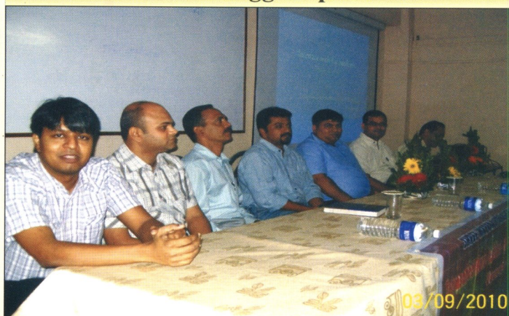
Interface with Ex-Students "Batch Of 1996"