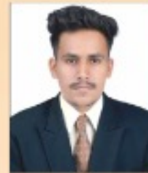
ARAGE AMOL Virtusa,Pune 4.50 LPA