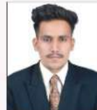
ARAGE AMOL Virtusa,Pune 4.50 LPA