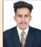
ARAGE AMOL Virtusa,Pune 4.50 LPA